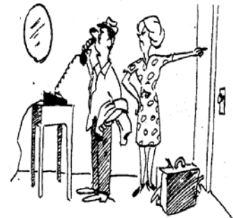
"Hello, AA? If I join, can I keep at least one resentment?"

Next Available Date is June. Hurry, they are going fast!!